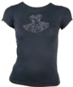
Irish Dance Dress Motif