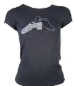
Jig Shoe Motif