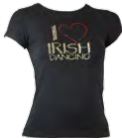
I Love Irish Dance Motif