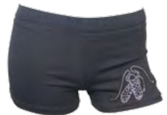
Double Diamante Pump Motif