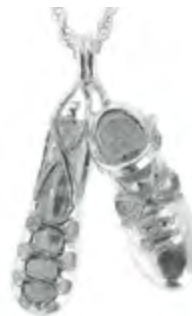
Small Double Pump Pendant