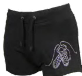
Double Diamante Pump Motif