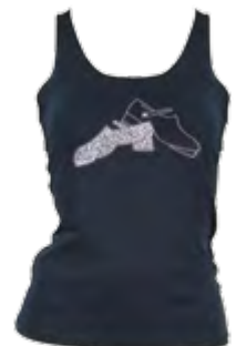
Jig Shoe Motif

Visit our website to view our full range of clothing