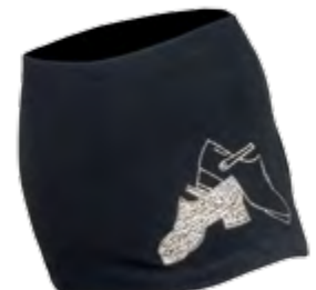
Jig Shoe Motif

Please visit our website to view sizing guides