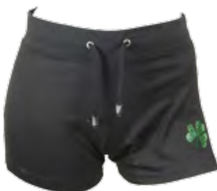
Studded Shamrock Motif