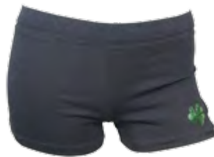
Studded Shamrock Motif