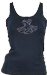
Irish Dance Dress Motif