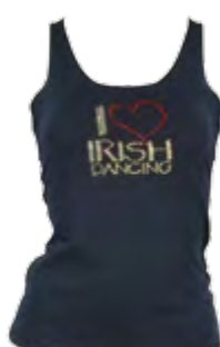
I Love Irish Dance Motif